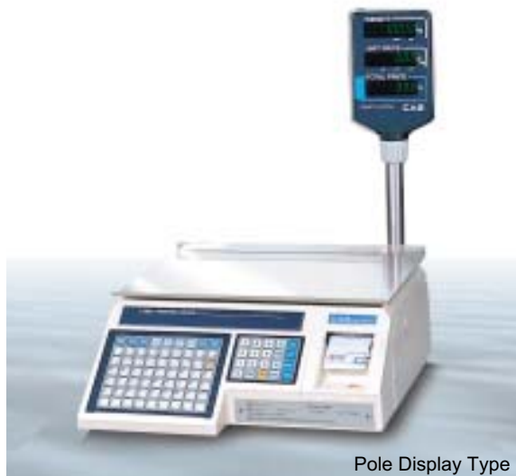
Pole Display Type